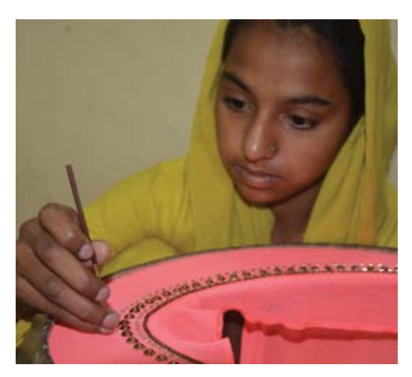
Since 2006, the Self-Employed Women's Association (SEWA) Bharat has been working to increase livelihood opportunities for home-based workers

This work itself is centered around three Embroidery Centres in slum areas. Situated very close to members' homes, these are used for linking members to the production process as well to support services like health training, microfinance, and skills training. Close to 800 home-based embroidery workers are linked to the centres on a regular basis, and they use the centres to collect and deposit work orders. A further 10,000 SEWA members use the centres for support services.