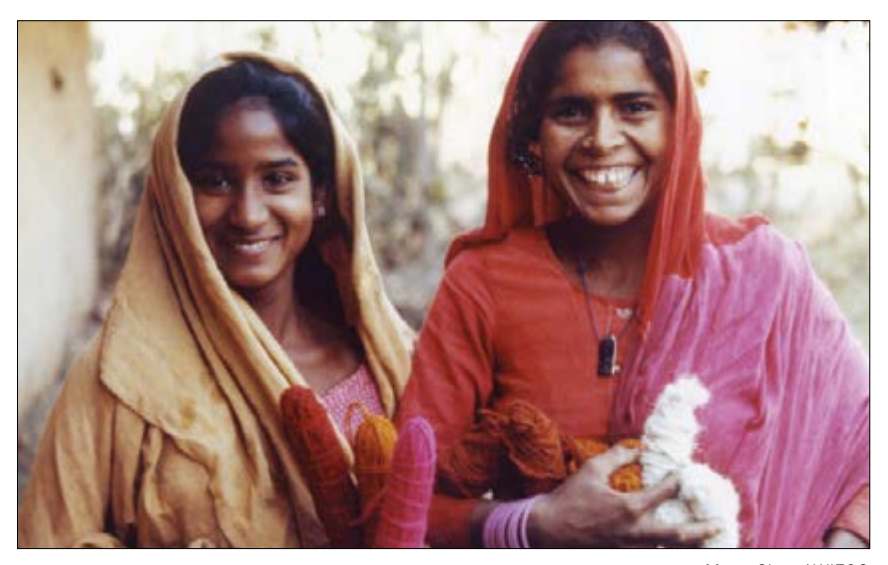
Marty Chen / WIEGO

Despite the rapid growth of industrial, administrative and other employment in Dhaka's formal sector, almost half (49 per cent) of the working population is employed in the informal sector (Sundquist 2008). With the growth of the garment industry in the 1980s and 1990s, a huge number of poor migrant women have found formal employment in the garment factories of Dhaka. Still, many of them work as piece-rate garment embellishers outside factory hours in their own homes. They are often involved in tailoring, sewing, block/boutique/printing, garment embellishing, handicrafts/hand-stitching and broom making.