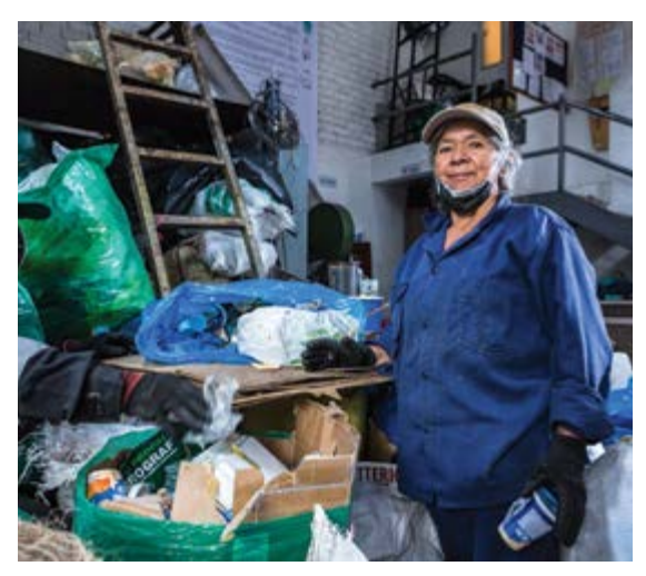
Since the 1990s, the Asociación de Recicladores de Bogotá (ARB) has been defending waste picking as a profession.