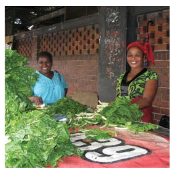
On April 7, 2011 the Fxecutive Committee rescinded its 2009 resolution to lease the FMM site to Warwick Mall (Ptv) Ltd.

exemplary relations with the trading community. This was in stark contrast to what was being presented by the Municipality or the methods and means it had chosen to deploy in its attempt to influence the community. Asiye eTafuleni believes it was in a privileged position to provide a stabilizing and strategic course of action throughout the struggle. This was undoubtedly reinforced by its international and local networks and the professional expertise of the Legal Resources Centre.